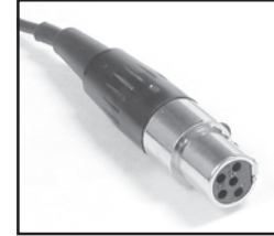
TA5F connector for Lectrosonics transmitters