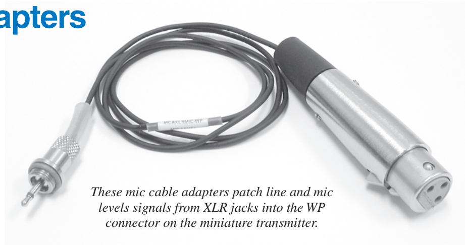
These mic cable adapters patch line and mic level signals from XLR jacks into the WP connector on the miniature transmitter.