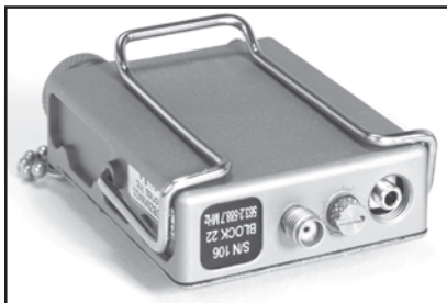
Typical MM Series miniature transmitter

This adapter allows microphones or audio devices with standard XLR connectors to be used with the MM Series miniature transmitters. A capacitor in the XLR connector blocks the DC bias voltage on the transmitter input jack from the output of the audio device being connected.