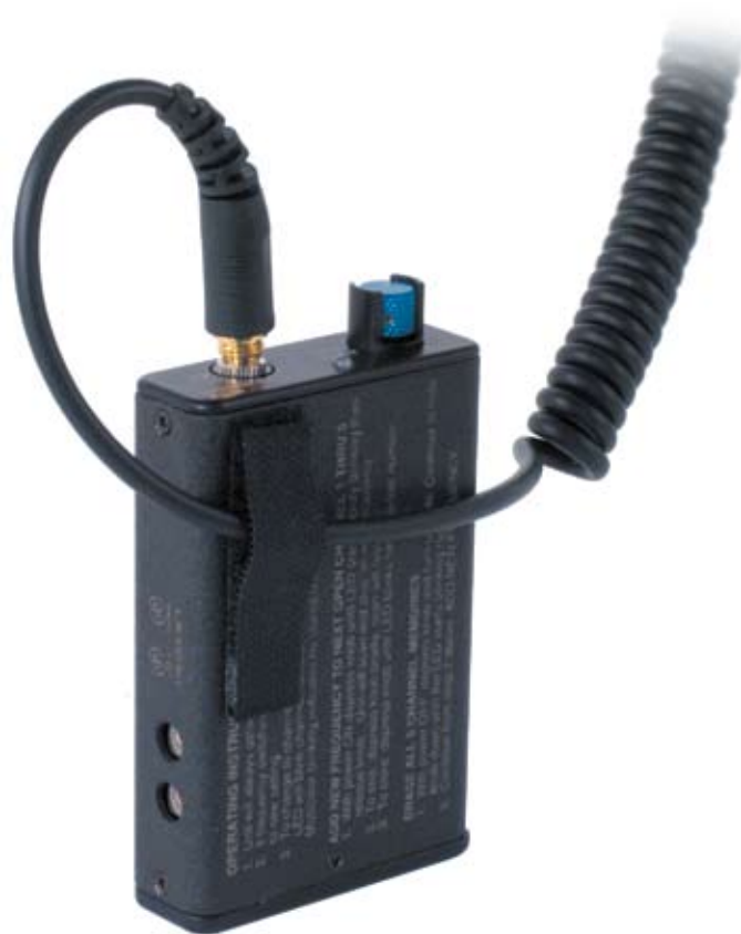
Figure 2 - Headphone cord strain relief

Strain relief to avoid accidental disconnection can be provided with the included small hook and loop strip. Attach the adhesive strip side to the side of the receiver with the opening end of the strip up - place the cord in the strip and secure.