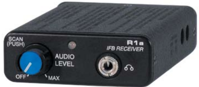
Figure 1 - R1a Control Panel

Refer to the RECEIVER OPERATING INSTRUCTIONS for full details on how to use the single knob control for channel selection, scanning, and programming of the five memory locations.