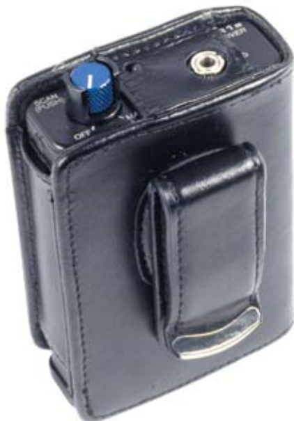
The R1a includes a leather pouch with belt clip to help protect the receiver and provide a way to secure it during use.

PROGRAMMING FUNCTIONS - In the programming mode, the LED will blink at a fast rate to indicate scanning for an active frequency. It also flashes briefly to indicate a frequency has been programmed into a channel.