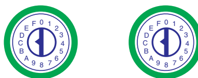
Figure 3 - Frequency Adjustment